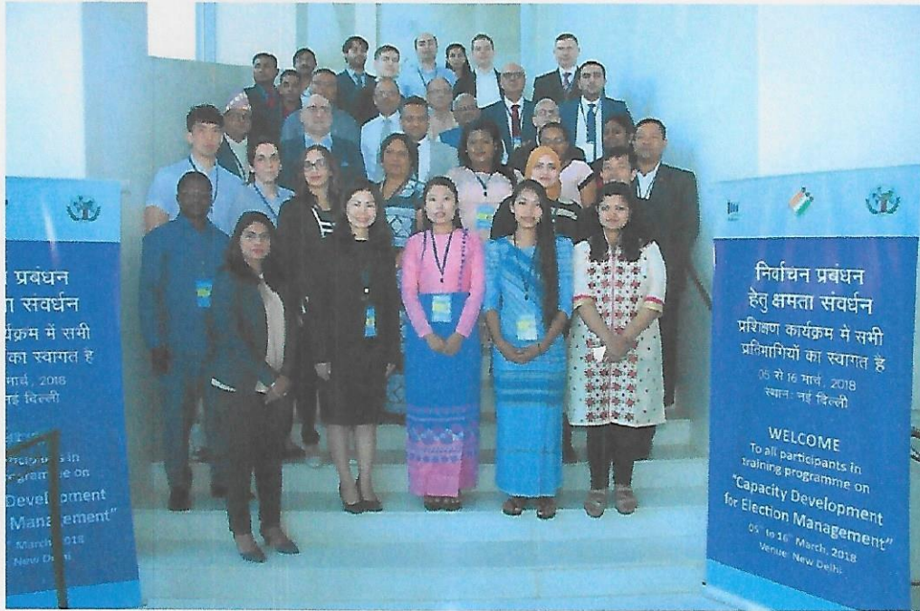
Participants from 21 ITEC countries at the training programme

The India International Institute for Democracy and Election Management (IIIDEM) is conducting a training programme on 'Capacity Development for Election Management' under the Indian Technical and Economic Cooperation (ITEC) programme of the Ministry of External Affairs (MEA), Government of India. The programme is being held from 5 th to 16 th March, 2018. As many as 29 senior and mid-level officials from EMBs of 21 ITEC countries are participating in the programme.